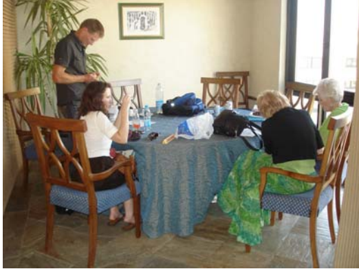
Planning day in Jordan